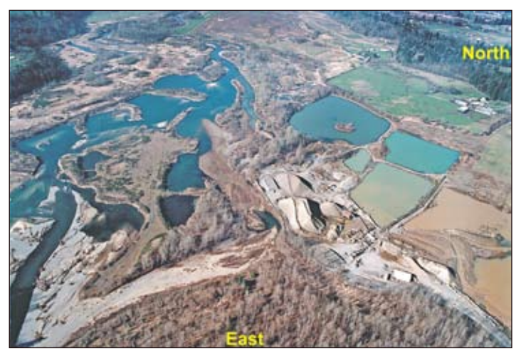
View of Storedahl's Ridgefield operation, which was shut down years ago by Clark County Commissioners due to land use zoning inconsistencies and Clean Water Act pollution issues.