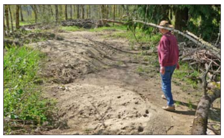
This photo, taken 1,000 feet downstream from the gravel pits, shows how sediment has washed over the pits onto private land.

This photo shows how sediment from the current Storedahl gravel pit has blocked the mouth of Dean Creek. Despite one of their gravel operations being shut down by court order three years ago, Storedahl is seeking to expand its mining operations on the East Fork Lewis. In February, a Superior Court judge upheld a ruling by the Clark County Commissioners to deny expansion of their operations.